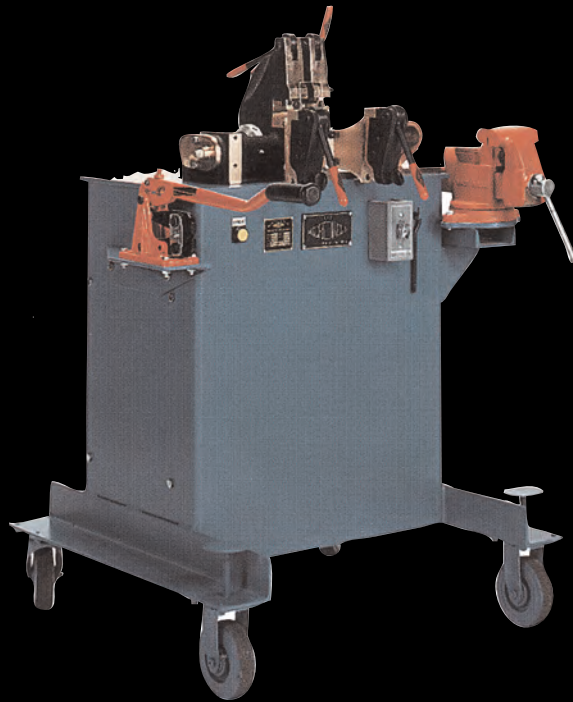
Model THD Steel Rod Butt Welder